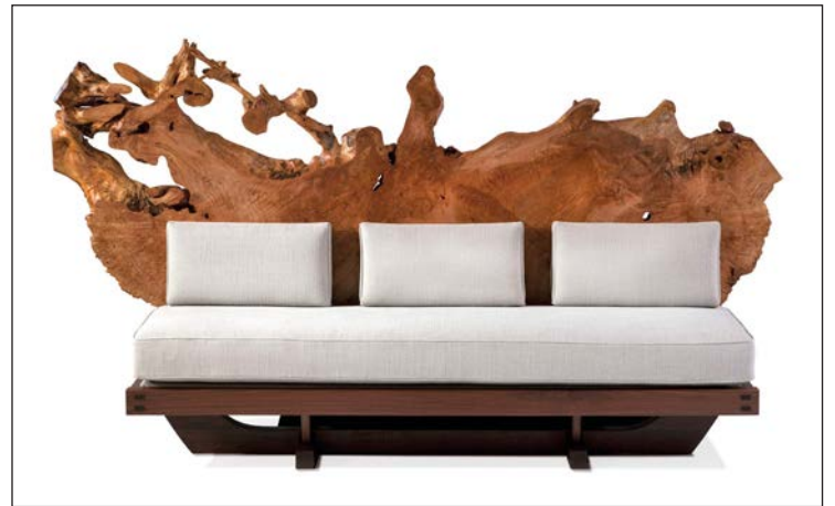
"Tsuitate" sofa by Mira Nakashima. Burl maple, walnut, fabric. www.nakashimawoodworker.com.

The second exhibition, "Maynard Dixon's New Mexico Centennial," features more than 100 paintings and drawings by Dixon (1875–1946), an American painter and muralist known for his masterly treatment of Western landscapes, animals and people. This is the first time in more than 25 years that a major Maynard Dixon public exhibition has been on view in the state and 100 years since Dixon's first exhibition at the New Mexico Museum of Art in Santa Fe. The display is a remarkable opportunity for showgoers to see and purchase Dixon's work.