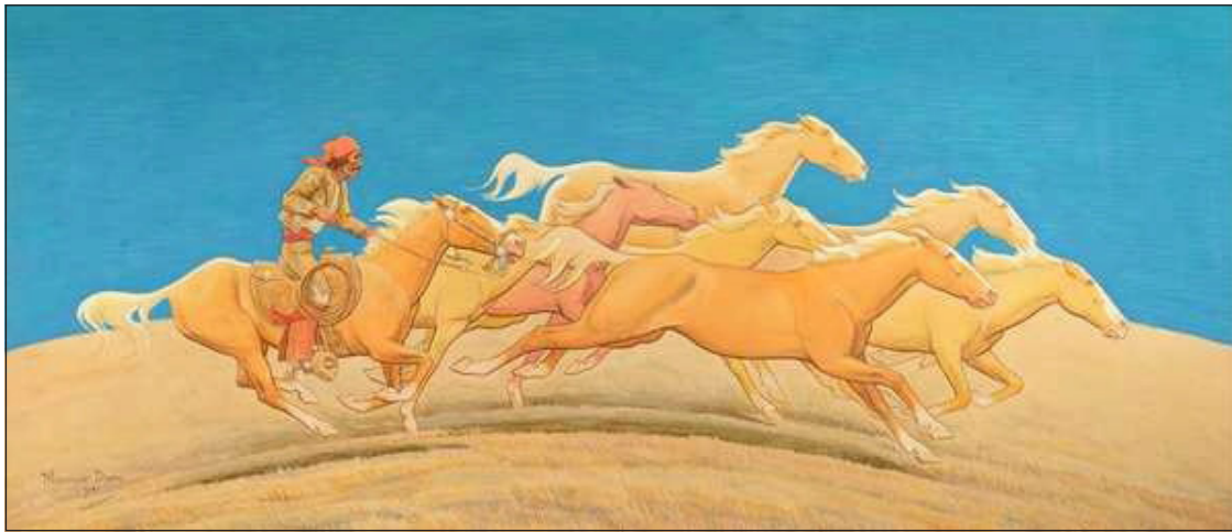
"The Palominos" by Maynard Dixon, 1941. Mark Sublette Medicine Man, Tucson, Ariz.

SANTA FE — Objects of Art Santa Fe, the city's favorite summer showcase for unique, one-of-a-kind historic and contemporary works from around the world, returns August 9–12 with more than 70 acclaimed gallery owners and other exhibitors presenting thousands of choice art objects handmade by master artists and designers in a range of media.