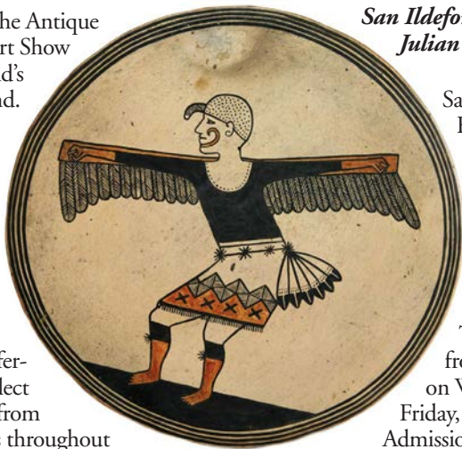
San Ildefonso polychrome pictorial tile with eagle dancer by Maria and Julian Martinez. Mark Sublette Medicine Man Gallery, Tucson, Ariz.

The four-day event takes place Tuesday through Friday at El Museo Cultural de